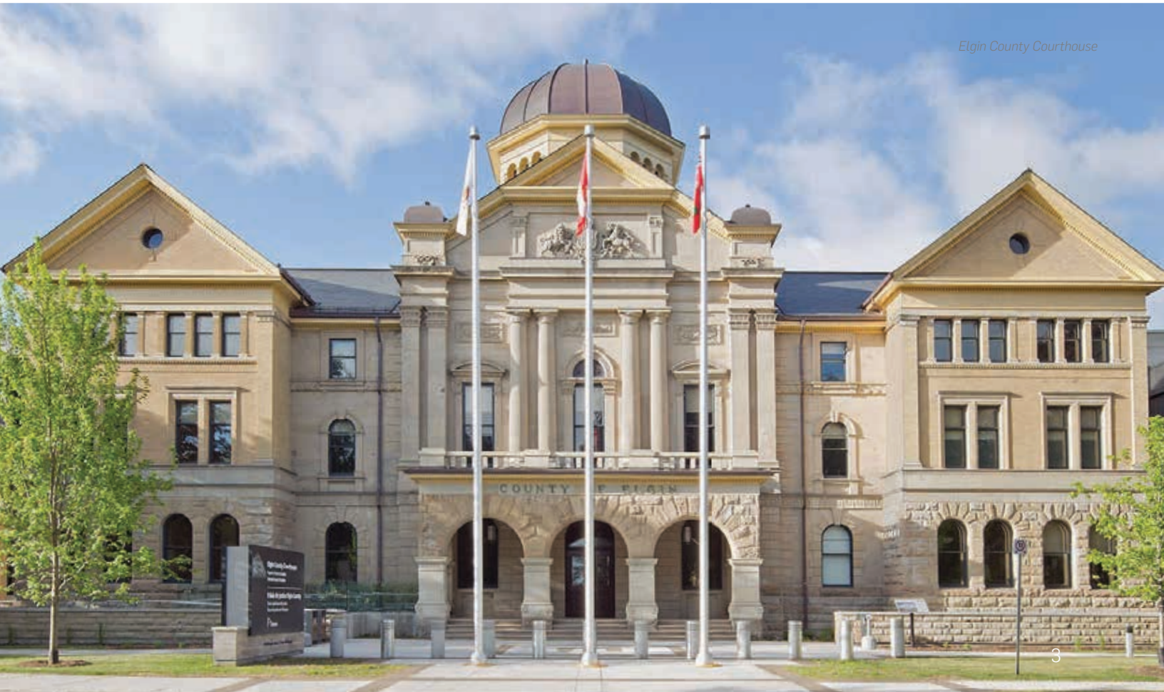
Elgin County Courthouse